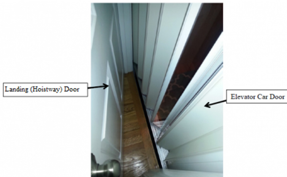
Typical Private Residence Elevator with Exterior Landing (Hoistway) Door and Interior Elevator Car (Accordion) Door